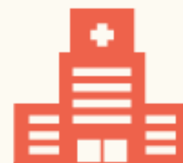
Skilled Nursing Facilities