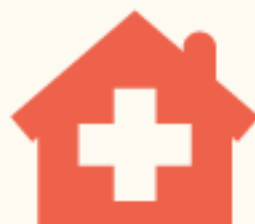
Home Health Care