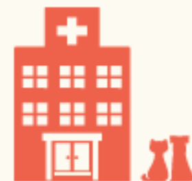
Veterinary Hospitals and Clinics